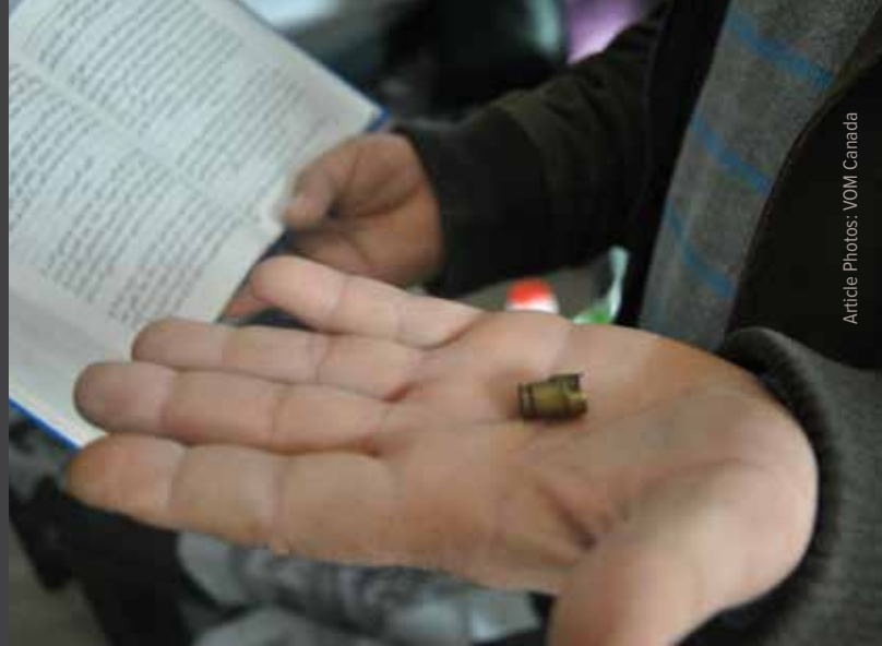
Article Photos: VOM Canada

“I am here today only because people like you found the truth of Jesus and then shared it with me.” ~ Tass Saada, Author of Once an Arafat Man